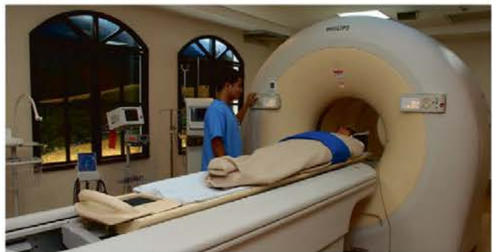
STATE-OF-THE-ART technology add to the competence and efficiency of hospitals and clinics.